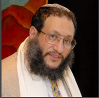
Mottel Baleston Messianic Ministry