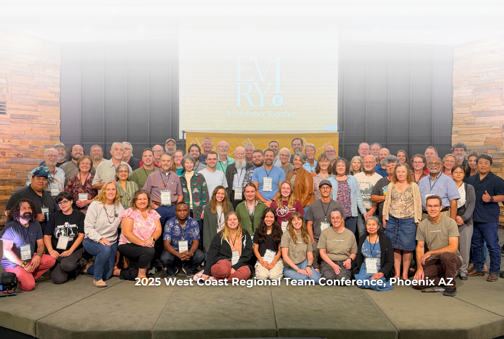
2025 West Coast Regional Team Conference, Phoenix AZ